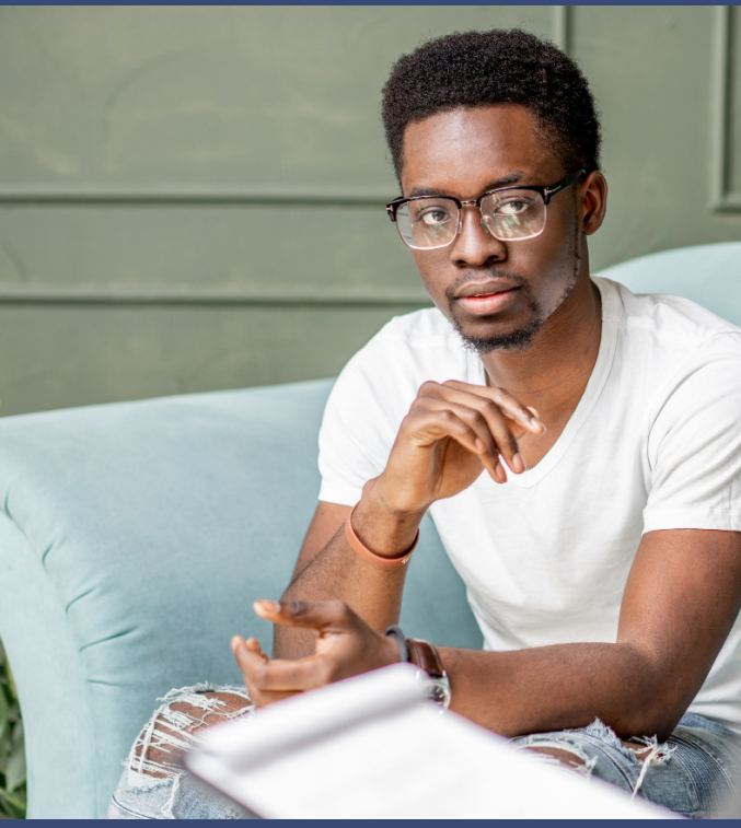
Psychological testing is covered by most insurances.

Evaluations can help individuals better understand their cognitive strengths and vulnerabilities, assist with clarifying complex diagnostic questions, and provide guidance to the individual's providers in regards of medication and treatment.