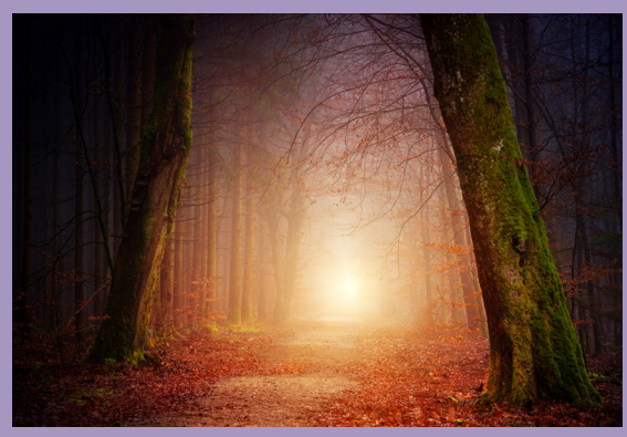
A place where all paths of recovery are respected.

Stairway to Recovery Peer Engagement Center gives those in recovery the support and access to the tools they need to enhance a life free from alcohol and other drugs. A safe environment where peers can come together and find growth, explore life's opportunities, give back to the community, participate in recovery focused groups, recovery oriented social activities, perform outreach, and many other great offerings of recovery.