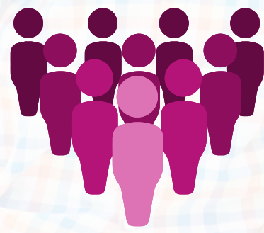
Substance Use/ Recovery