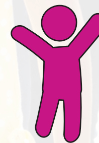
Intellectual + Developmental Disability Services