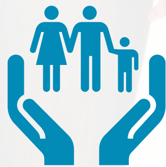
Child + Family